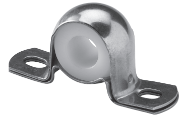
PBSS-UH - Series

USDA and FDA approved. For wash-down applications in wet or harsh environments or where sanitary conditions are a factor. Self-lubricating bearings resist corrosion, high impact and abrasion. Two-piece stainless steel housing units. Interchangeable with most metal units. Tolerates -60° to 180° F. (UHMW-PE bearing replaceable – see below.)