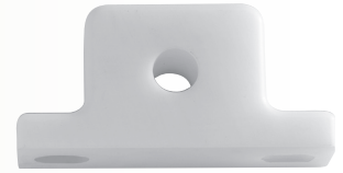
PBUH-UH - Series

Entire unit is UHMW-PE. USDA and FDA approved. -60° to 180° F temperature range. For wash down applications in wet or harsh environments or where sanitary conditions are a factor. Self-lubricating bearings resist corrosion, high impact and abrasion. Interchangeable with most metal units.