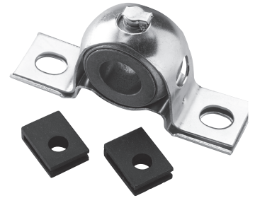
PBPS-BR - Series